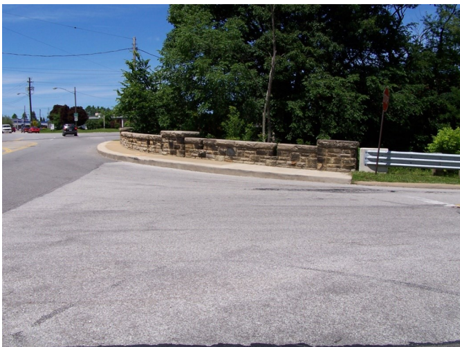
View of Euclid Creek East Branch from bridge

White Road and Richmond Road: bridge you'll be monitoring from