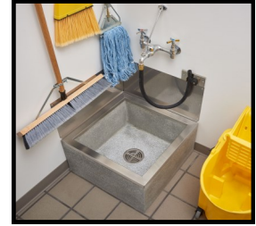
Mop sink