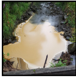
Restaurant grease in a river