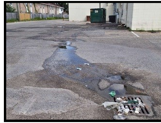
Leaking dumpster into storm drain